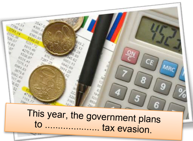
This year, the government plans to ..... tax evasion.