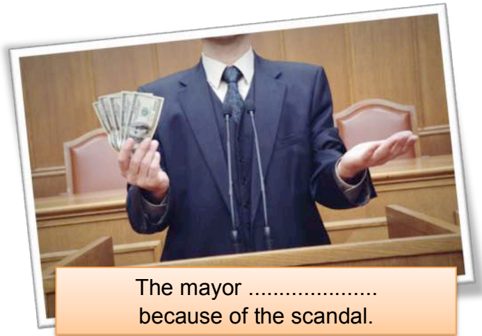
The mayor ..... because of the scandal.