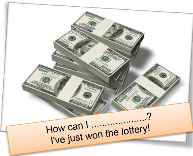
How can I .....? I've just won the lottery!