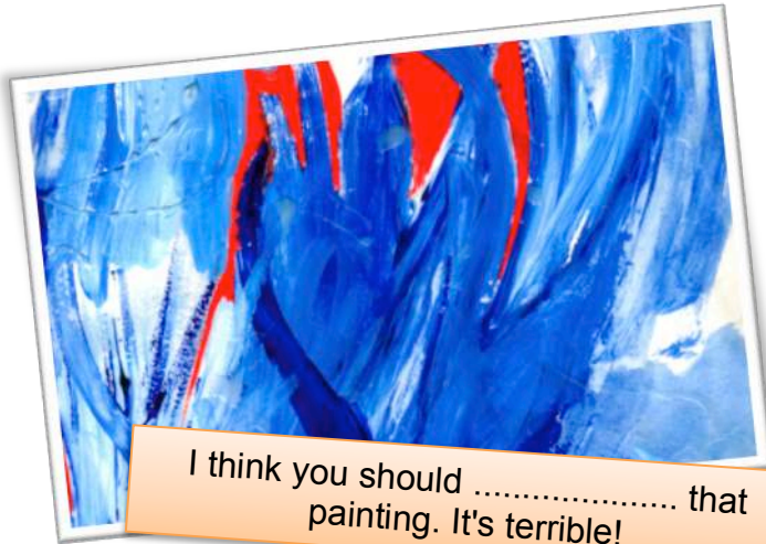
I think you should ..... that painting. It's terrible!