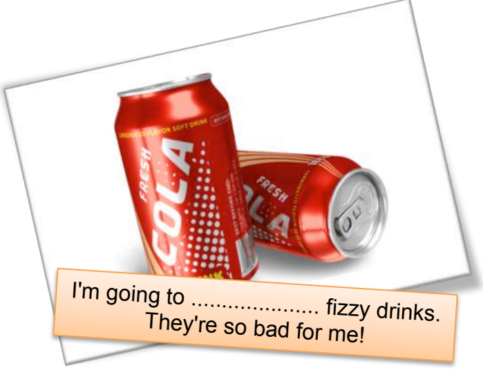
I'm going to ..... fizzy drinks. They're so bad for me!